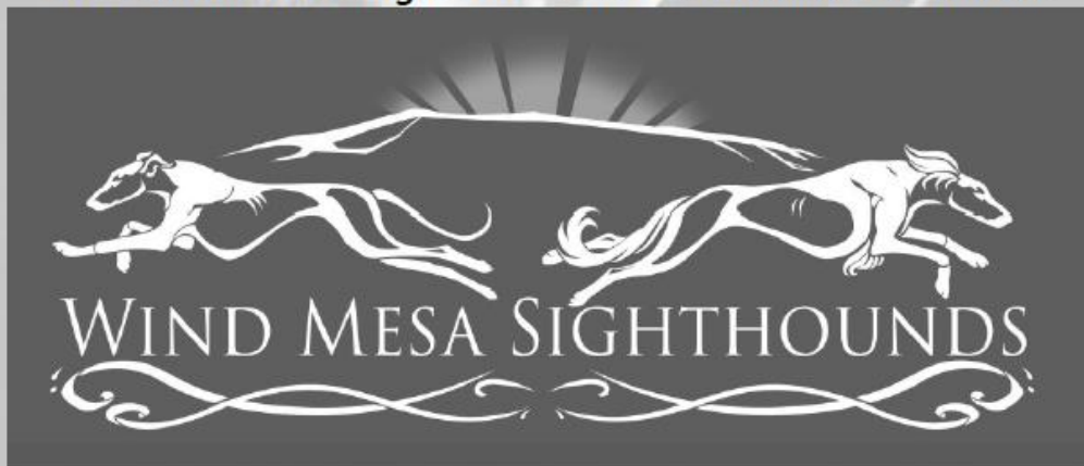
2020 Grand Nat'l Singles BIE—2021 Grand Nat'l Overall BIE