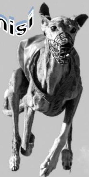
2019 Grand Nat'l BIE Runner-Up