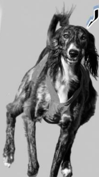
2022 & 2023 Test Dog for BIE